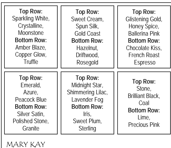
Display Tray #2

Cut out the eye color pictures from page 32 in the Look Book and tape them into the bottom side of your tray, so you know the names of each. You'll easily know all the names of colors and so will your customers!