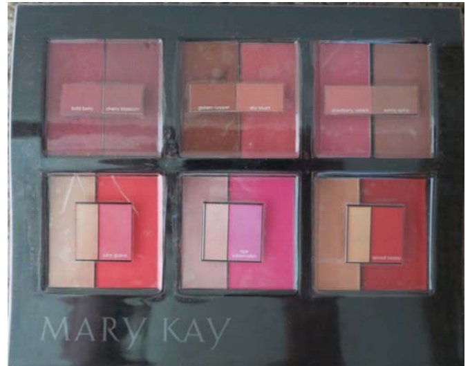
Color tray with plastic lid over colors!