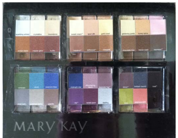
Color tray with plastic lid over colors!

***Helpful Hint: We used packing tape that filled the entire square on the tray cover so you can't see tape marks!